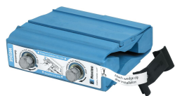
Wedge og Wedgekit